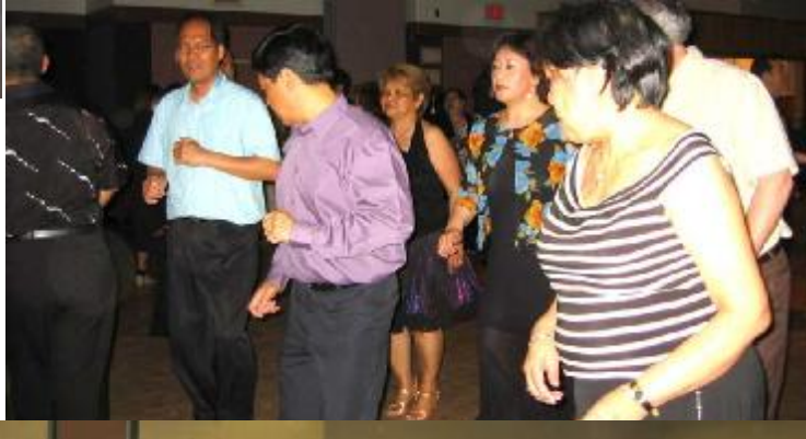
...and the joyful celebration continued through the night!

This was evidenced by the festive mood of everyone in the full capacity room of the dance hall – the laughter, the joyful fellowship, the hustle and bustle of everyone as we go through the program of the evening, of great food being shared together and the tireless dancing to the tune of wonderful music being played by our DJ.