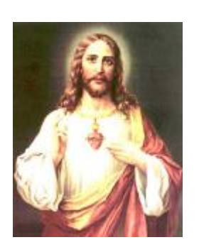
Join the Magnificat Community to the Devotion to the Sacred Heart Every First Friday of the Month 7:30 p.m. – Regina Mundi Chapel

404 North exit Greenlane (turn right), left on Woodbine Ave. first traffic light – right on Mount Albert Rd. Then left on Warden Ave.