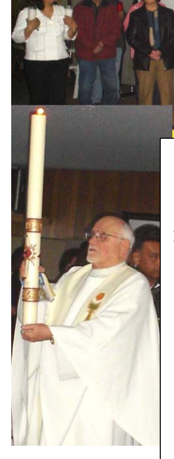
"Christ is Risen! Truly, He is Risen"

The community proclaimed with fire and song that Christ is truly risen. To all our friends, guests and Magnificat family, thank you for celebrating with us the Easter Triduum. Indeed, these are amazing events and the holiest days of our faith.